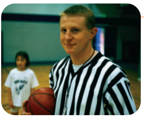
Fees to join sports teams help pay for referees.