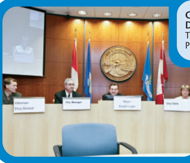
City, Town and Rural District Councils This photo shows Grande Prairie's city council in 2007.

First Nations Governments This photo shows the Chief and Council of the Siksika Nation in 2007.